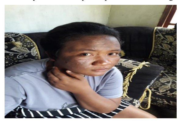
Figure 1. Patient of Leprosy

The results showed that one Participant took the drug for six month P1, seven participants took medication for one year and five participants took the drug once.