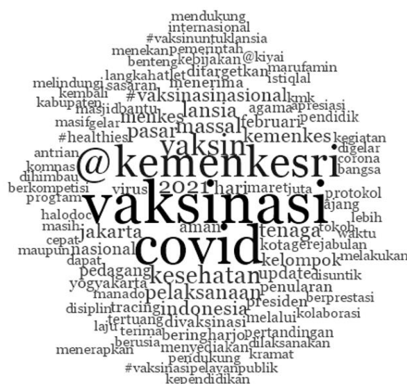
Figure 3. Word Cloud Result Source: Author Analyzed by Nvivo12+

The implementation of government programs is a form of concern for all Indonesian people. The encouragement and support from others are an indicator of an ongoing program that will develop various sectors of human life. The analysis results show that there are activities regarding communication-related to a clear and official bureaucratic structure made by the Government of the Republic of Indonesia that can get the best results for all Indonesian people in fighting COVID-19. Figure 4 shows the openness of data and information provided by the Ministry of Health of the Republic of Indonesia in the era of the COVID-19 pandemic, which implies open knowledge.