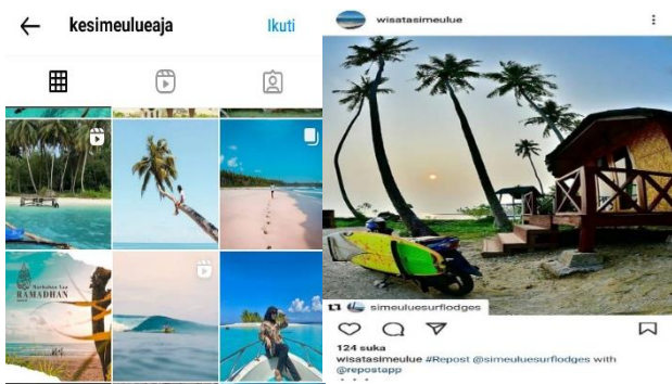
Figure 5. Instagram media that participates in promoting marine tourism in Simeulue

Several social media have helped the Simeulue Regency government to promote Simelue marine tourism including the Kesimeulueaja IG account, Wisatasimeulue as shown in Figure 4.