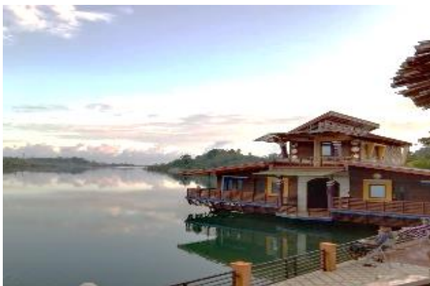
Figure 8. One of the lodgings in Simeule Regency is D'Fit Homestay ( dokumentasi penelitian 09 September 2022)

Business actors are parties who collaborate for the process of developing a program run by the government. Business actors in Simeule are engaged in lodging such as guest houses, home stays and resorts. However, there are no star-rated hotel facilities in Simeulue Regency, especially around the city. The resort ownership is private in nature which is scattered in several sub-districts such as West Teupah, Central Teupah and South.