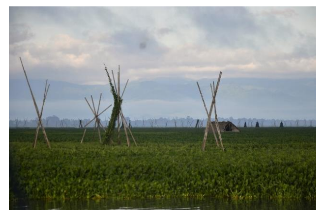
Figure 2. Bungka Toddo Fishing Equipment

However, some old fishermen claim that using grass poison killed the fish eggs hiding between the gaps in the soil, lowering the catch potential for fishermen. As a result, small fishermen employ a variety of ways to ensure appropriate catches, including the usage of Jabba , which, according to the Fisheries Service it is violates the regulations even though it had not yet been incorporated into Regional Regulation No. 4 of 2012. When the government banned it and wanted to act firmly by confiscating the Jabba , the Bungka Toddo , which also broke the rules, was not confiscated. According to residents, the Fisheries Service rarely or never goes out into the field to enforce the regulation regarding the Bungka Toddo (AIFDR, 2015).