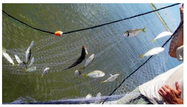
Figure 3. Lanra Fishing Equipment

On another occasion, fishermen from Lake Tempe gathered to the Regional People's Representative Council office to demonstrate their concerns about the ban on fishing in Lake Tempe, particularly in the Sabbangparu Subdistrict (Sulselexpose, 2021). The prohibition is related to the use of a fishing tool called renreng . The community expressed their goals, emphasizing that the existence of this prohibition has had a substantial impact on their livelihood. They maintained that many infractions continue to occur in the area, and that the prohibition is discriminatory, particularly when compared to the use of fishing nets (Lanra) recommended by the government through regional regulations. The community also emphasizes the risk of loss for fishermen who utilize Lanra, specifically the harm caused by the sapu-sapu fish (Tokke) to their fishing nets. As therefore, the community expresses concern and seeks resolution regarding this situation. The community's demanded for responses indicates the significance of determining a middle