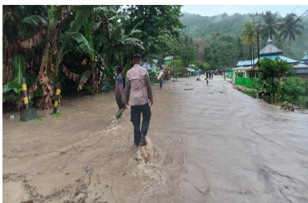
Figure 6. Flood Conditions in Gorontalo Regency

"Confirming it by going directly to the field, the evidence or the physical is necessary... For example, here there is disaster damage, meaning that reports from the community through the government brought by the District Government enter here, from the regional disaster management agency verify by going to the field to make sure". (Interview, May 31, 2022)