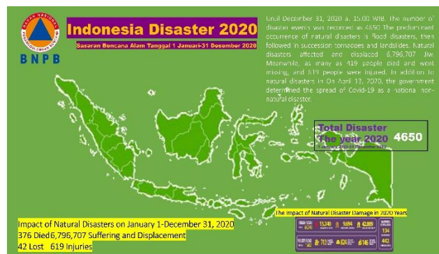
Figure 1. Infographic on Indonesia's Disasters in 2020

Every year, Indonesia experiences more than 300 flood events that cause the area to be inundated to reach 150,000 hectares and cause losses to around 1,000,000 people. In addition, floods remain the most common disasters in Indonesia, as data shows that in 2020, out of 4,650 disaster events in Indonesia, 1,518 were floods. Meanwhile, in 2021 floods also continued to dominate with 1,268 of the total 3,009 disaster events recorded according to BNPB data as of December 24, 2021, as we can see in the following figure.