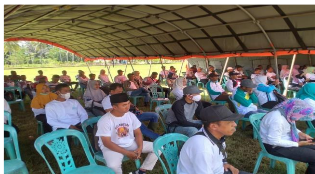
Figure 5. Socialization of Disaster Resilient Villages

Alhamdulillah, at the regional flood disaster management agency, I always tell them that the leader in this regional flood disaster management agency is only one person, so whatever I convey is the leader's order and must be conveyed (the leader's policy) from top to bottom, and (policy) must be implemented. There should never be a dualism of leadership, so they also understand very well that if for example there is an order from me, it must be carried out from the secretary, the head of the field, the section head to the staff. And that's what I always say at the morning apple implementation'. (Interview, May 31, 2022)