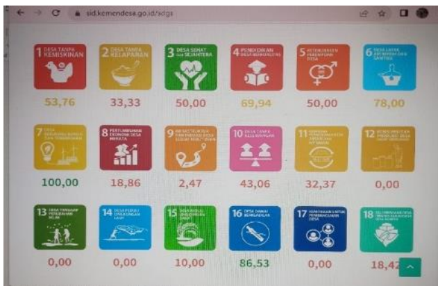
Figure 2. SDGs Indicator Values of Gunung Muda Village

The implementation of SDGs Gunung Muda Village has implemented Village SDGs since 2021 by starting to map the existing potential and resources. All existing potentials are then sorted and mapped to be included in categories and indicators according to the Village SDGs Categories and Indicators of the Ministry of Villages.