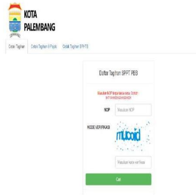
Figure 2. Website related to Land and Building Tax in Palembang City

virtual accounts via the V-Tax Tax Application, but they need further development. The V-Tax Tax Application is an independent Taxpayer service that includes verification, mutation services, new tax object services and bill checking. This application also allows taxpayers to view the history and information related to the services being submitted to Local Area Networks Providing Internet Networks in Digital Transformation. The Policy for Providing Land and Building Tax Stimulus in the City of Palembang is sufficient through collaboration with Internet Network Provider Vendors at the Regional Revenue Agency of Palembang City as well as UPTs within the District and Service Application Developer Vendors for network maintenance and tax payments so that they can be accessed properly