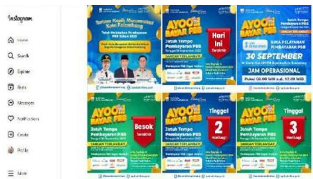
Figure 3. Utilization of social media to convey information related to the UN in Palembang City

The preparation website in the Digital Transformation Policy for Providing Land and Building Tax Stimulus in the City of Palembang is accommodated in the website Palembang City Regional Revenue Agency which is managed independently by staff and can be accessed well via the link https://pbb.palembang.go.id and can be accessed well, apart from that, information related to PBB payments can also be found