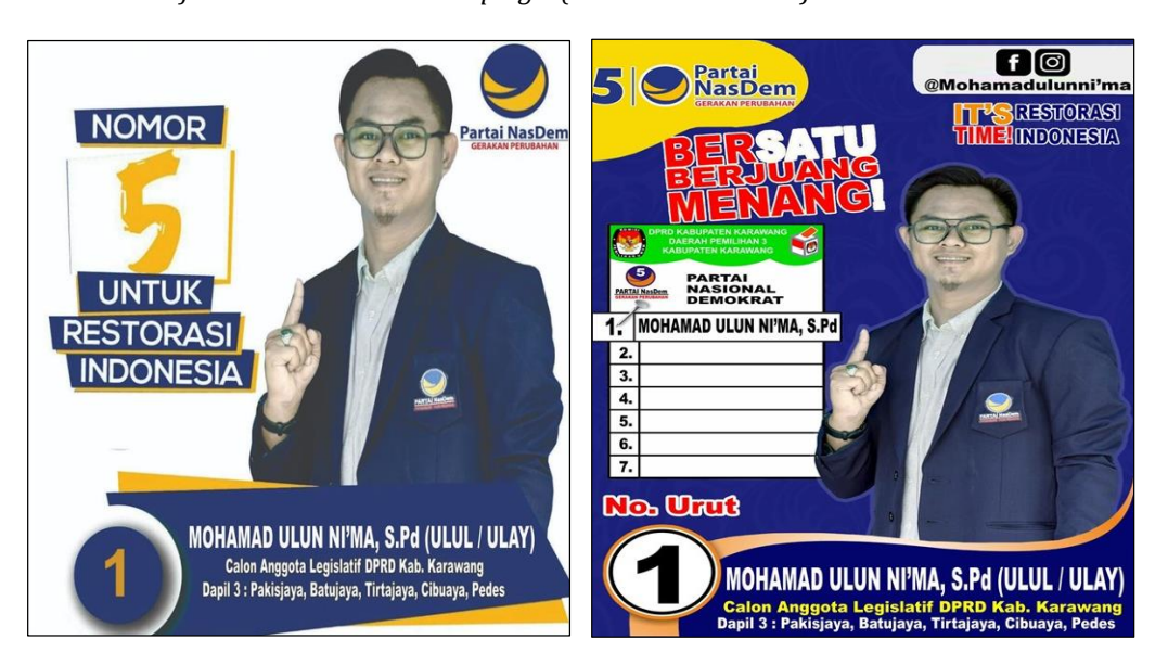
Figure 2. Poster for legislative candidate Mohamad Ulun Ni'ma Source. Data from sources

"In addition, for campaign props such as billboards, banners, and flags, we were instructed to put them up on small roads or alleys, not on the side of main roads. This is more effective because people see them more often and remember them more easily. On small roads, people also pay more attention because they are not driving fast. In addition, we put up banners at the team's house to show their support. And for social media, we use platforms such as Facebook, Instagram, and TikTok to share pamphlets and information about the campaign" (Interview Mustofa).